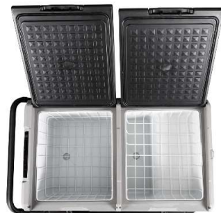
DUAL ZONE | INTERNAL BASKETS