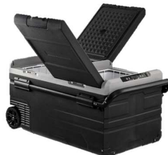
TWO OPENING DIRECTION REMOVABLE DOORS