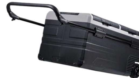
RETRACTABLE HANDLESS HEAVY-DUTY WHEELS